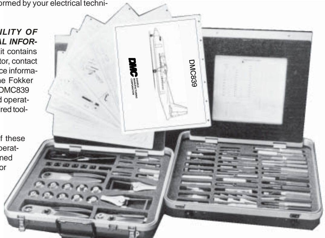
Actual kit may vary from example shown.

an environmentally sealed fiberglass case and includes: Name Plate, Foam Pads/Inserts, Contents Charts, Instruction Charts, and Tool-to-Connector Cross Reference Charts.